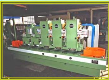
Grinding/polishing machine with 3 belt units + 2 mop units