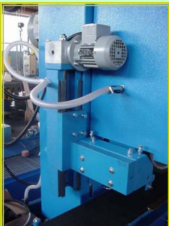
Detail of independent pressing group

The number of units depends on the type of working to be made. As the machine is modular, it is possible to add other working units afterwards. The machine can be used for different applications such as grinding or polishing of tubes, flat bars, shaped sections and sheets made of stainless steel, iron, aluminium, copper, brass, etc.