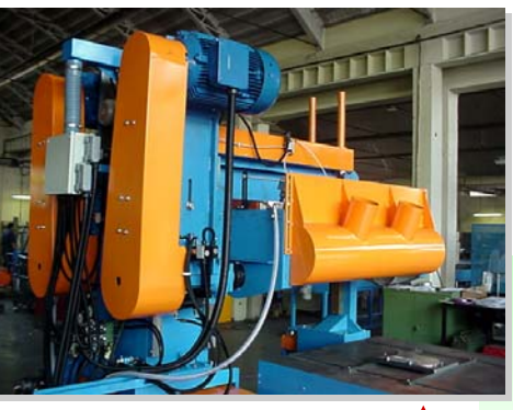
Details of mops carriage