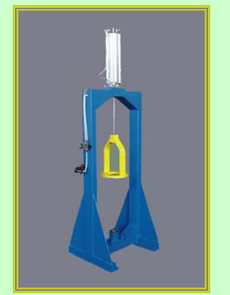
Press for assembling the polishing mops, with pneumatic control