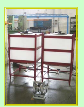
Storage bins for liquid abrasive compound