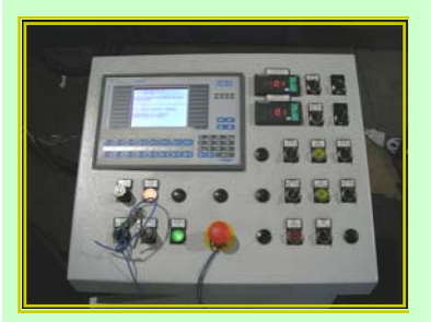
Electronic control by PLC