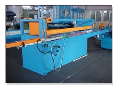
Hopper loader for medium-short pieces