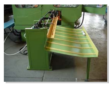
Unloader for medium-short pieces