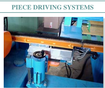
Vibration conveyors for very short pieces