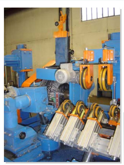
Detail of mop unit, aluminium roller conveyor along the machine and pinch-roll with double wheel