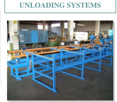
Automatic unloader with table